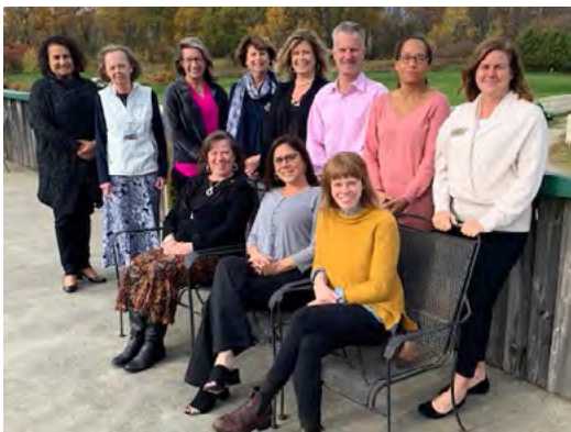
Board members at the October 2019 KidSafe Board Retreat